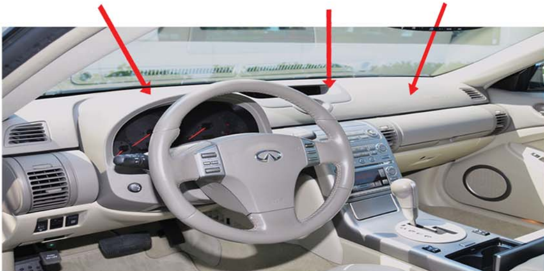
Recommended Installation placement

Determine a suitable mounting location under the top dashpad for the GPS device. Ideal locations are directly under the dashpad skin, above the glove box, or above the gauge cluster. Do not glue the top of the Stealth directly to the bottom of the dashpad.